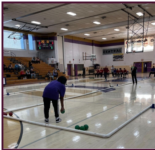
The bocce in play!